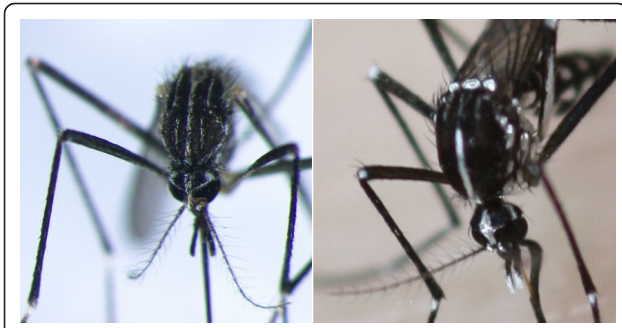
Figure 2 Particular of the mesonotum of Aedes koreicus (left) compared to Ae. albopictus (right).

albopictus , which is mainly based on the use of inexpensive ovitraps. The detection of the typical black Aedes eggs in ovitraps, easy recognizable by non-expert personnel, was sufficient to determine the infestation status of a location with regard to the tiger mosquito. Unfortunately, tiger mosquito eggs are indistinguishable by simple observation under a binocular microscope from the eggs of other Aedes spp., including those of Ae. koreicus . Hence, the species identification at a routine basis in areas where Ae. albopictus and Ae. koreicus may share the same breeding sites, will require to rear the eggs in the laboratory or to include into the surveillance system the more laborious systematic collection of larvae and adults, which require an equipped laboratory and well trained personnel for identification (Figure 2).