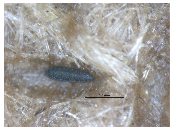
Fig. 2 Aedes japonicus egg on a wooden paddle from an ovitrap in Lower Austria

(Becker et al. 2017), countries neighboring Austria. Most Ae. albopictus eggs in this study were found in Northern Tyrol, where the first eggs were documented in 2016 at one site along the main travel routes from Italy (Walder 2017). In 2016, no adult mosquitoes were caught at that particular oviposition site and a singular event was assumed, confirmed in 2017, when no further eggs were detected at the site. However, in contrast to previous years, in 2017, there was repeated evidence of oviposition at several sites with a high egg count in the Lower Inn Valley. Although this does not provided proof for the establishment of a self-sustaining population of the Asian tiger mosquito in Northern Tyrol, the distribution of the positive sites and the time of detection are indicative of